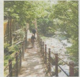
Footwork: On the Izu Geo Trail, above, and sumo fighters in action