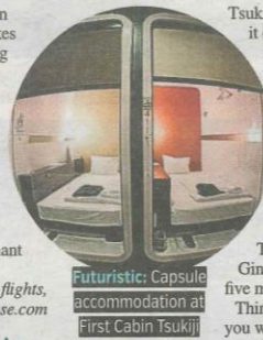
Futuristic: Capsule accommodation at First Cabin Tsukiji

Kip in a first-class cabin TOKYO is awash with five-star hotels but there are less costly sleeps to be had. One exciting but cheap-as-chips place is capsule hotel First Cabin